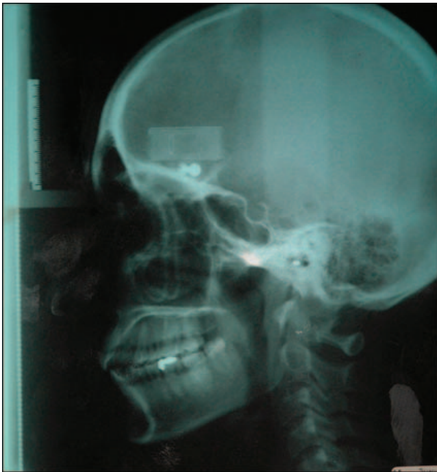
Figure 1. Radiograph taken in the natural head position. A 0.5-mm wire was adopted on the fluid level device to represent the true horizontal, and the vertical chain can be seen clearly.

gender. Because craniofacial features such as size, shape and form, and facial pattern will show variations in different genera, races, and subraces, normative data should be maintained for each racial group. Therefore, knowledge of normal dentofacial patterns of each ethnic group has much importance.